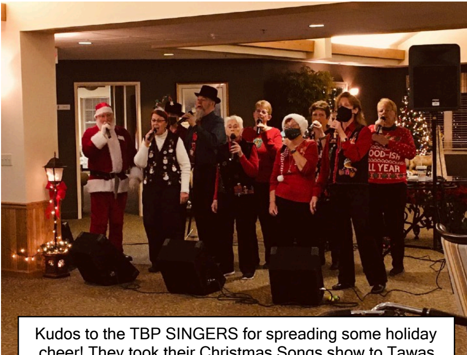
Kudos to the TBP SINGERS for spreading some holiday cheer! They took their Christmas Songs show to Tawas Village to entertain the residents there. Way to go, Singers!

Tryouts are set for March 9 and 10 at 5:45 pm at the TBP theater. If you’re not a teen, you can always help out backstage!